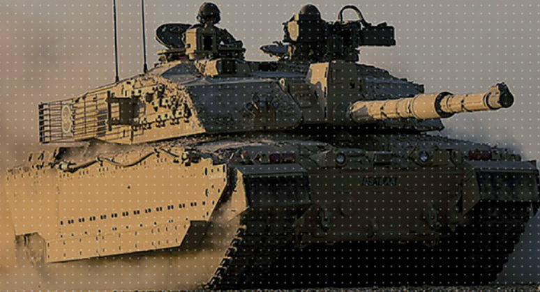
Armoured fighting vehicle without Dust Skirts

Permali's dust skirts are designed to provide the optimum balance between stiffness and flexibility from a synthetic fire-retardant rubber composite designed for Armoured Fighting Vehicles (AFVs). The system ensures the operational risks caused by sand and dust are mitigated; Permali's dust skirts can also be applied to wheeled AFVs.